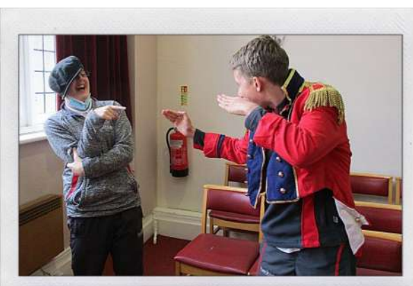
Shylock: You call me misbeliever, cutthroat dog, And spet upon my Jewish gaberdine (Act 1, Scene 3)