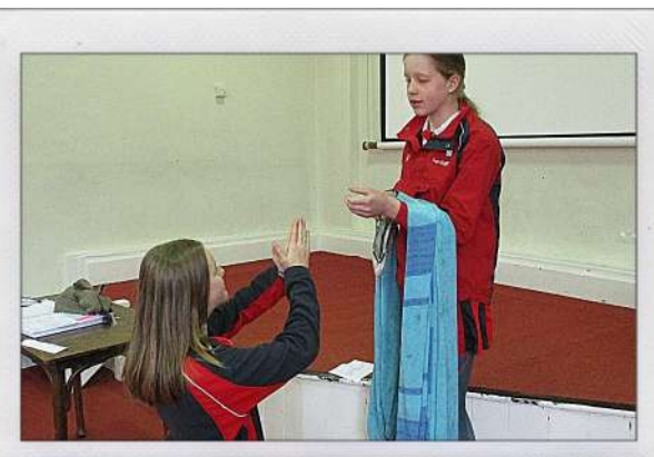
Prince of Morocco: Mislike me not for my complexion, The shadowed livery of the burnished sun (Act 2, Scene 1)